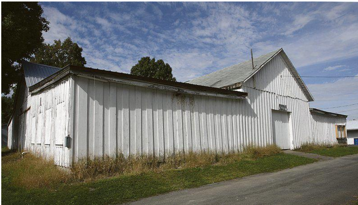
The floral hall at the Otsego County Fairgrounds in Morris is shown Thursday.