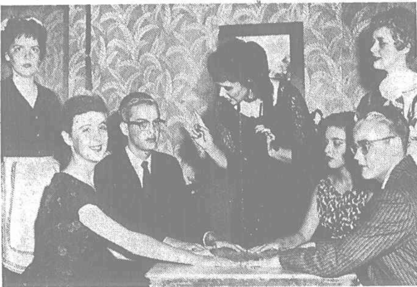
IMPROBABLE FARCE —Oxford Academy and Central School students rehearse for senior play, "Blithe Spirit," by Noel Coward. Closing performance is at 8 o'clock tonight in the school auditorium.