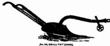
NO. 30. SMALL TWO WHEEL