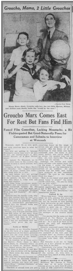
Groucho, Mama, 2 Little Grouchos