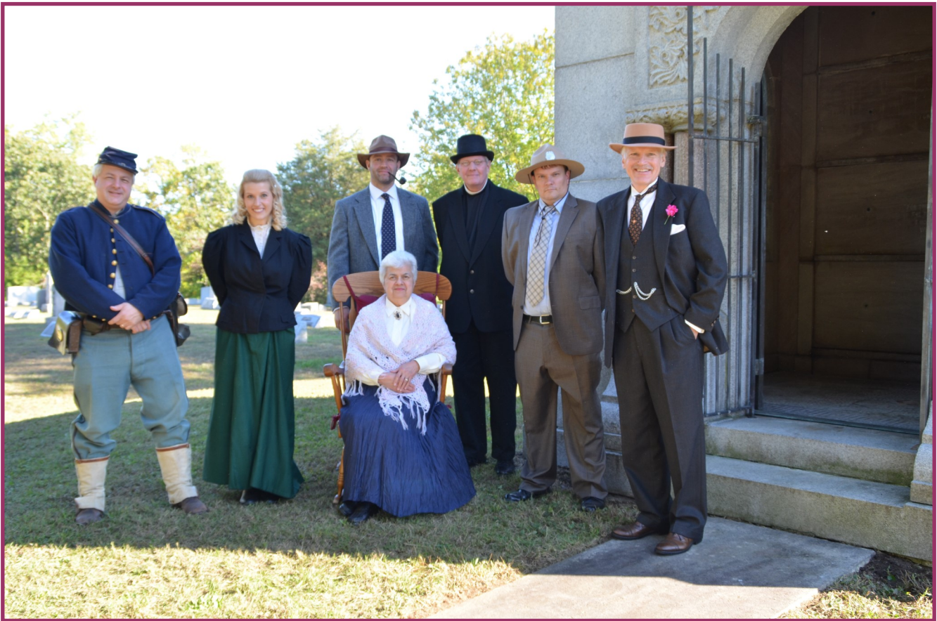
A scene from the Annual Wenonah Cemetery Tour in 2019.

O n Saturday, October 9, the Wenonah Historical Society and the Wenonah Cemetery Association will host its sixth annual sixth annual cemetery walk from 1-3 p.m. The tour is free and no tickets are needed. Every plot has a story to tell! Get a glimpse of what life was like in the early 1900s. Every script is researched, using historic newspapers and primary source material. Graveside presentations will be dramatized by actors in period costumes. Come and experience this compelling living history at Wenonah Cemetery and take a peek into the Chew mausoleum!