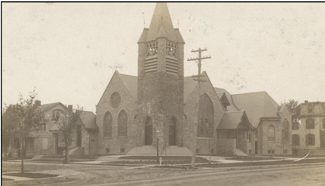
Postcard of the Wenonah Presbyterian Church, circa 1910