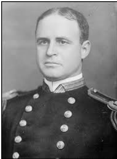
Admiral Mark Lambert Bristol

Reprinted with permission from the Bulletin of the Gloucester County Historical Society