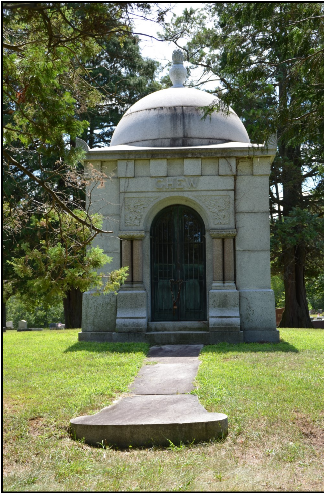
Chew Mausoleum, Wenonah Cemetery

By 1900, Wenonah was a thriving town with about 500 residents. Philadelphians built “cottages” to enjoy the beautiful lakes and to escape the city heat. Wenonah was considered an ideal community with telephone and electric service and streets laid out at right angles. It was populated by many Philadelphia businessmen.