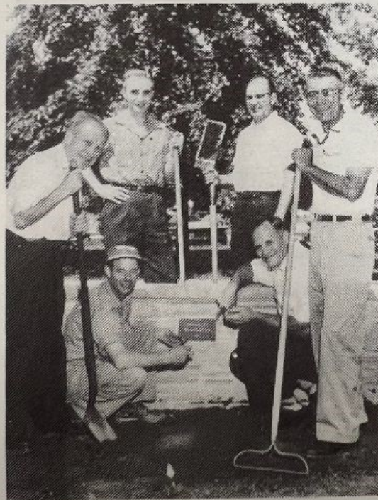
A few of the Lions pausing for picture taking during construction of a bandstand in the Wenonah Borough Park.

Thanks to everyone for helping make Wenonah's 150th July 4 parade and festivities a big success! This is a time when all come together as a community and celebrate our wonderful town with a parade that is the envy of many!