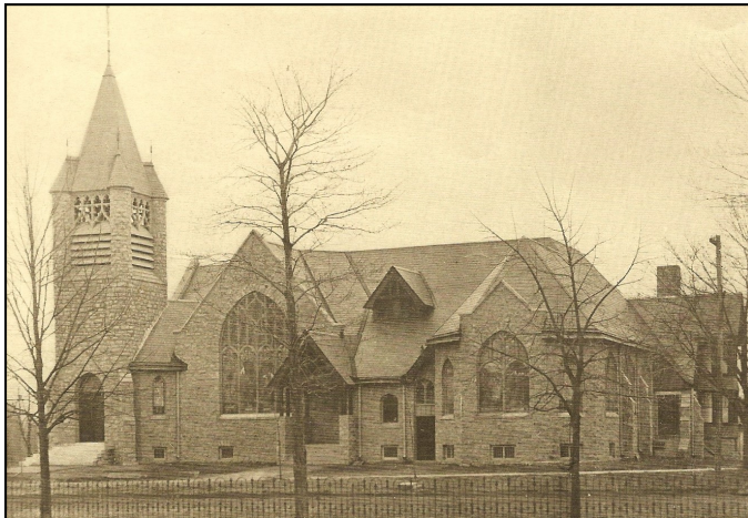
Memorial Presbyterian Church, Wenonah, NJ, 1904 Today it is listed on the National & NJ Registers of Historic Places