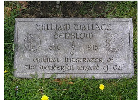
The footstone of William Wallace Denslow in Kensico Cemetery, featuring his seahorse insignia and images of the Scarecrow and Tin Woodman