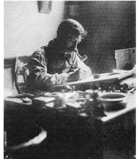
William Wallace Denslow, photographed in 1900