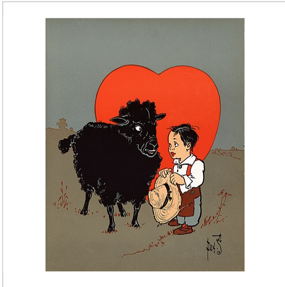
The Black Sheep, from a 1901 edition of Mother Goose

Denslow wrote and illustrated a children's book called The Pearl and the Pumpkin .