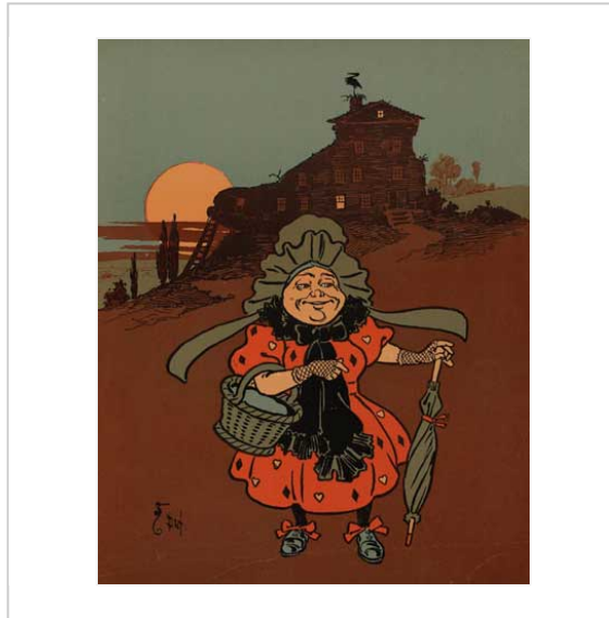
Denslow's illustration for " There was an Old Woman Who Lived in a Shoe ", from a 1901 edition of Mother Goose